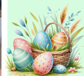
Jaimie Painting Easter Eggs