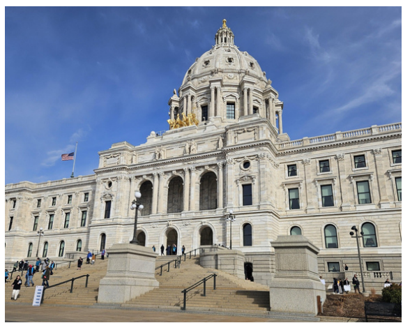
Photo: Advocates arrive at the Minnesota State Capitol to show support for disability services and speak with legislators.