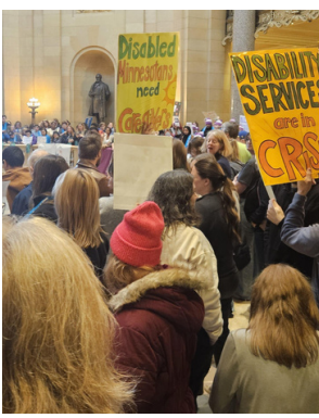
Photos above: Advocates fill the Minnesota State Capitol, holding signs and speaking out to protect and support essential disability services.