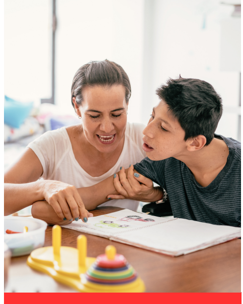
Now Hiring! Direct Support Professionals (DSPs)