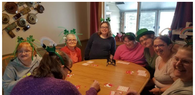
Glencoe and Milwaukee celebrating St. Patrick's Day and enjoying bingo.